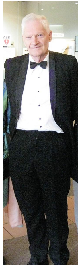
Hash gear as semi-formal =9/10 and Nickel B looking splendid = 10/10