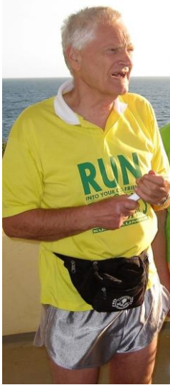
Hash gear as an aide memoire = 5/10